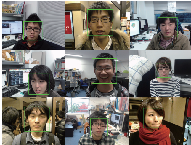
Figure 2: Examples of videos in the created dataset. The green rectangles represent detected faces.

require a memory assistance system so much. In Tables 1(b), the result of Q1 that asks how often you meet a person you cannot remember seems to reflect the bias. However, 2/3 of respondents sometimes encountered such a situation. Tables 1(c) and 1(d) show that most of respondents thought the situation is a problem and embarrassing. Table 1(e) shows that while the name is an important key to remember a person, other keys such as the places and events of previous en-